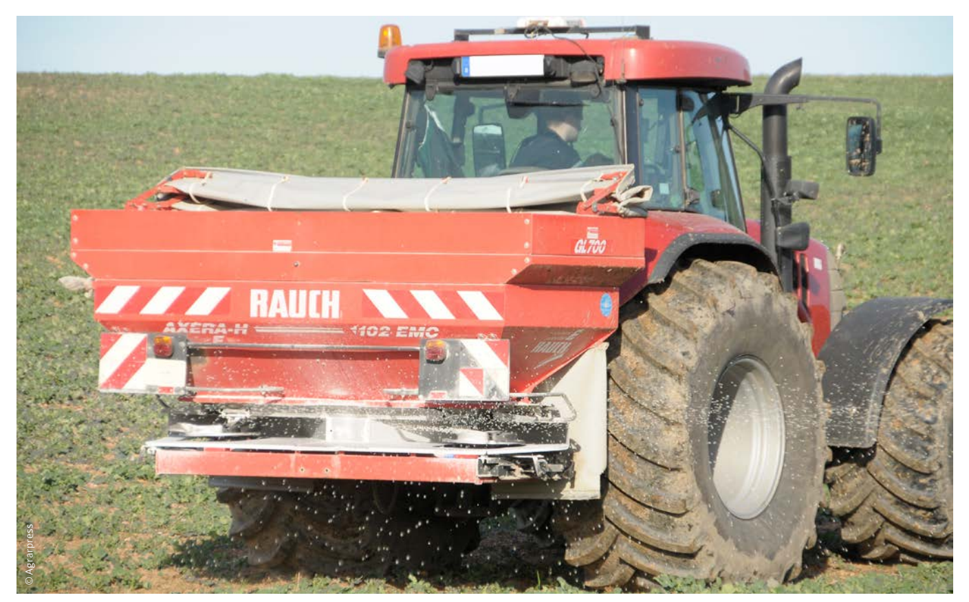
Using fertilizers produced with low emissions is an important strategy to mitigate greenhouse gas emissions. Without a certification system, however, farmers cannot assess if fertilizer production is climate-friendly.

In practice, the climate protection performance achieved for rapeseed cultivation is demonstrated by self-declarations based on standard values for yields and rapeseed production greenhouse gas emissions for the corresponding NUTS2 region.